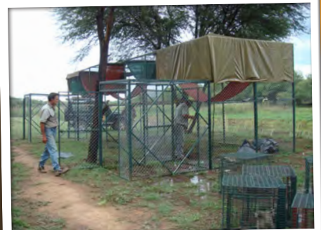
Inspection of the Release cages