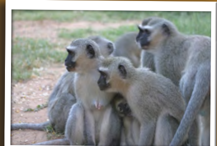
one for all, all for one