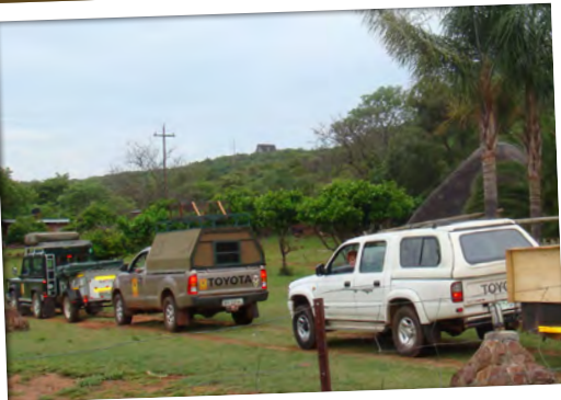
Departure Dec. 2009