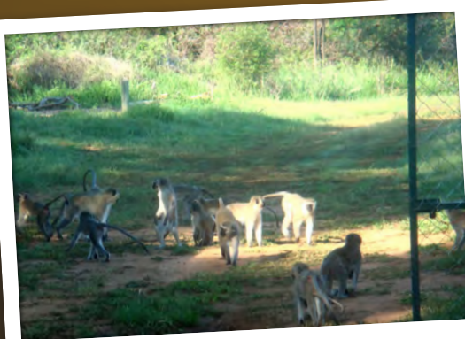
Doors wide open