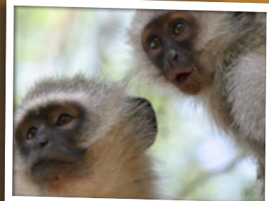
a future in freedom