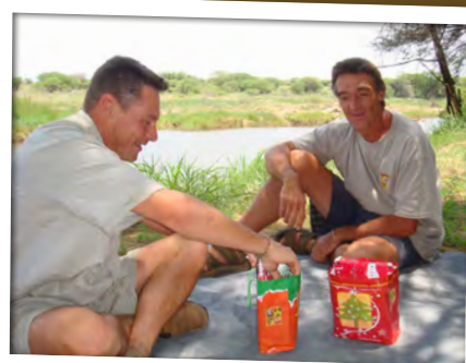
Christmas at Safariland's