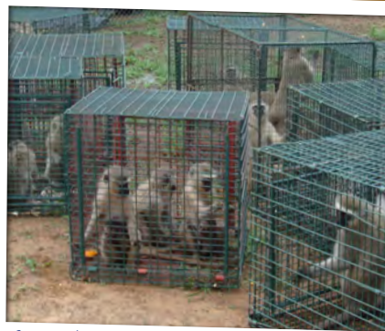
Arrival at Safariland's