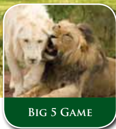
BIG 5 GAME