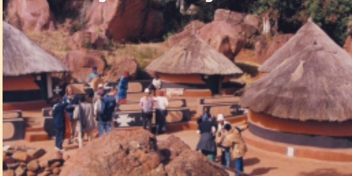
The Blouberg Cultural Village